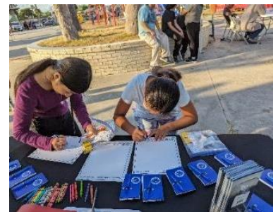
Picture: Parks After Dark Resource Fair at Bethune Park on July 28, 2023.